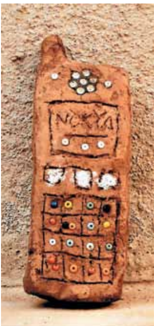
fig 5. (left, bottom) Mobile phone made with clay by a seven-year-old girl, village Lahfart, Anti-Atlas Mountains, 2005.