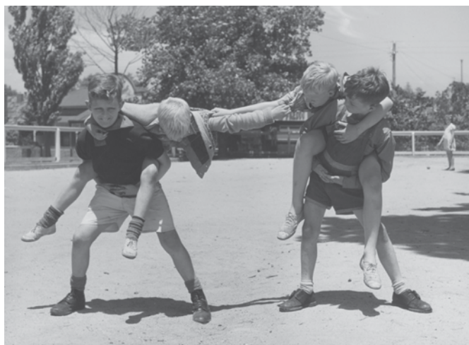
Schoolboys playing Cock Fighting or Hoppon Bumpo, Melbourne, 1954.