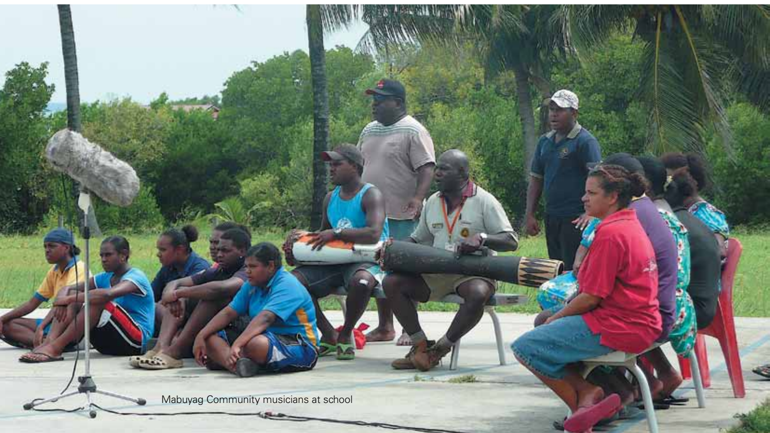
Mabuyag Community musicians at school