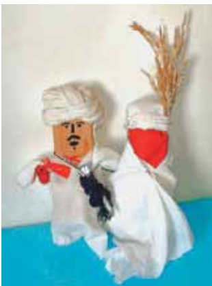
fig 1. (left, top) Traditional bride and bridegroom doll used for pretend play related to weddings, village Imjad, Anti-Atlas Mountains, 2006, made by a seven-year-old girl.

Influences promoting globalisation not only come from the international toy industry but also through media and migrants. A not insignificant role in changing Moroccan children's play habits and toys is played by family members living in Europe. When these emigrants return to visit their family they bring with them not only useful presents but also prestige presents including dolls, toy animals, teddies and toy weapons. In this way new and fantastic figures are entering the children's toy world, figures which were absent before.