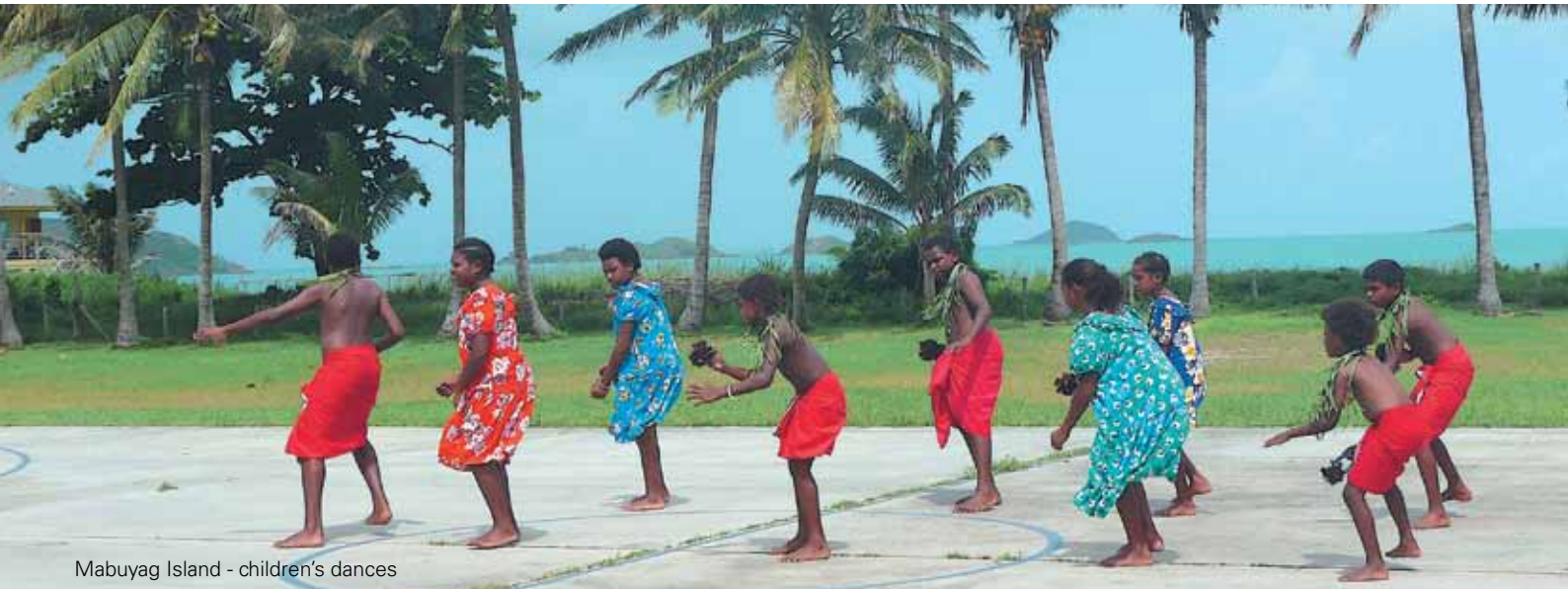
Mabuyag Island - children's dances