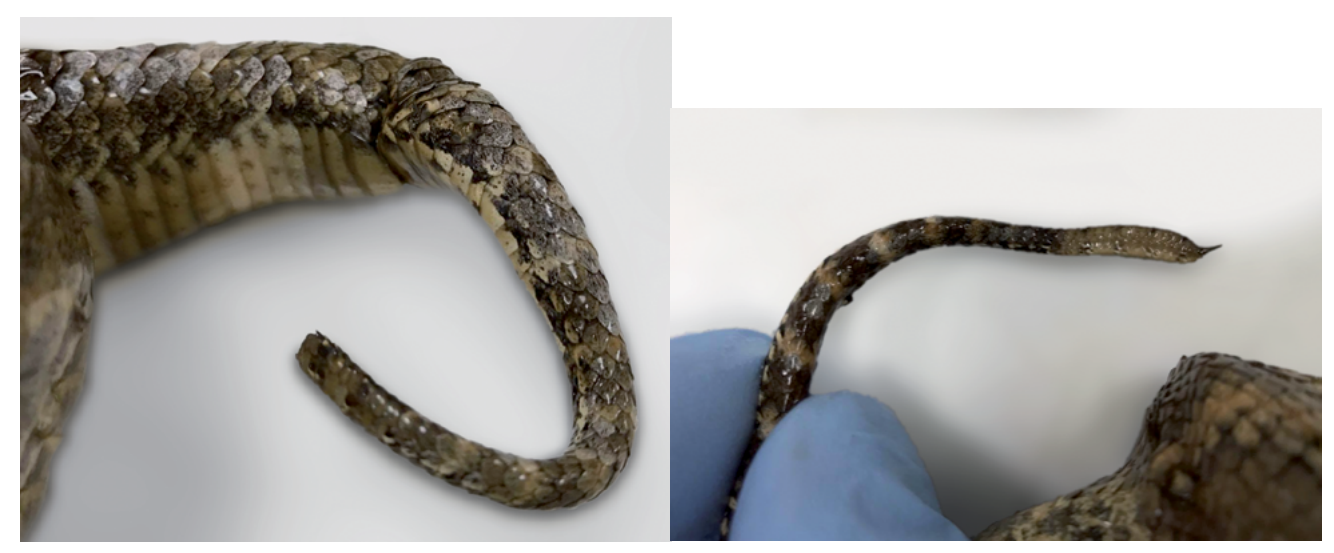
Figure 3. The truncated tail tip of death adder specimen D4349 (left) compared with the full tail tip of specimen D3579 (right).