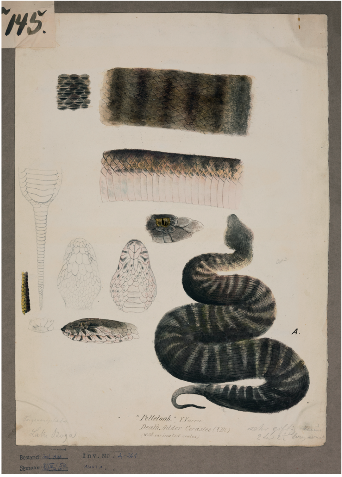
Figure 5. Illustration by Gerard Krefft of the death adder collected at Lake Boga in north-western Victoria on the 8 March 1857.