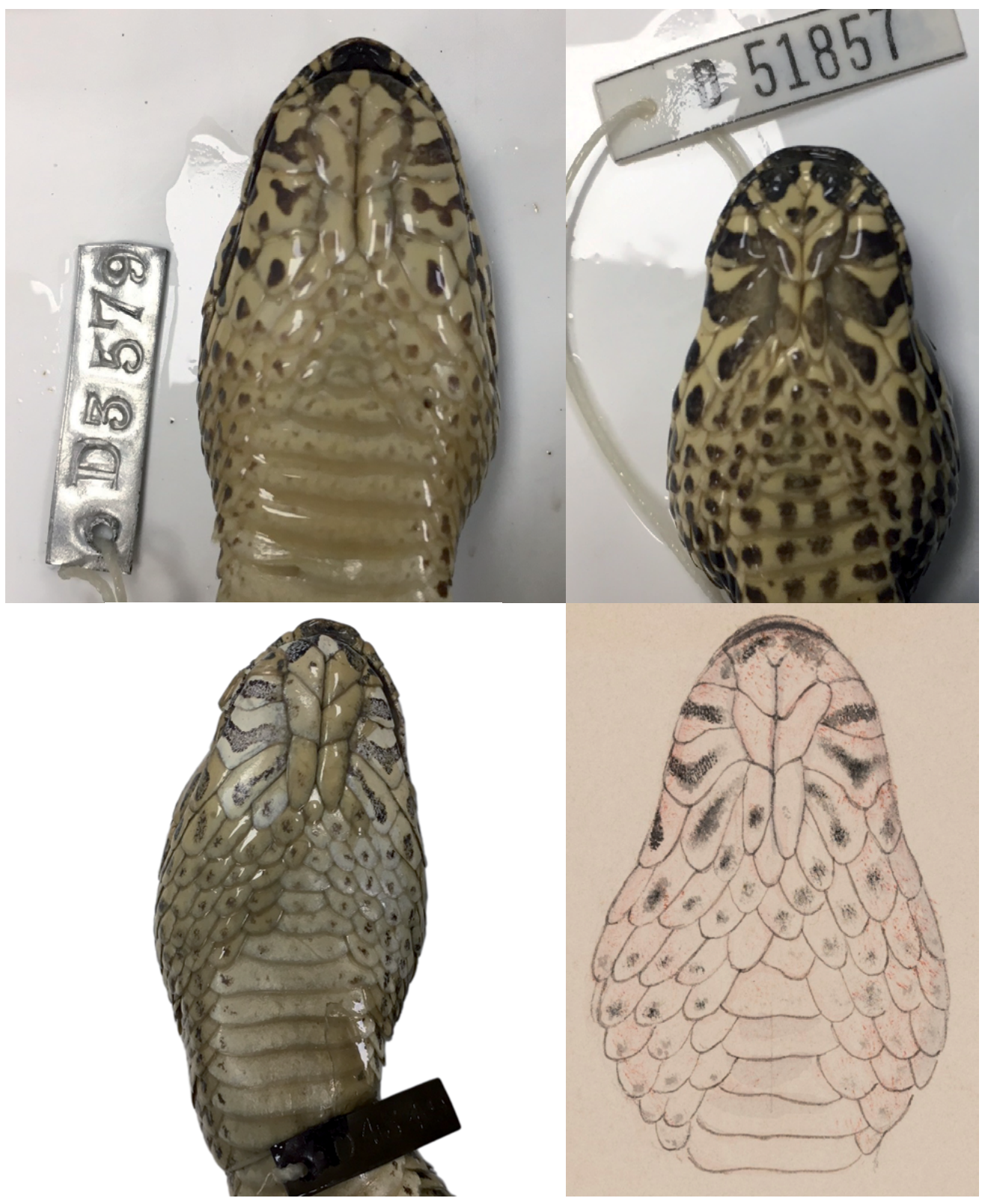
Figure 6. Ventral view of the head scales of Death Adder specimens from Melbourne Museum, and close up of Gerard Krefft's illustration of the ventral head scales of the Death Adder collected at Lake Boga in 1857 (bottom right). Top left is specimen D3579. Top right is D51857. Bottom left is D4349.