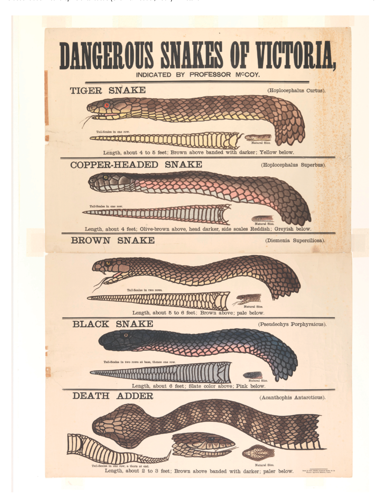
Figure 7. First edition of the Dangerous Snakes of Victoria poster, produced in 1877.