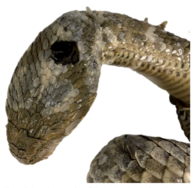
Figure 4. Dorsal perspective of the head and neck (including neck wound) of specimen D4349.

Expedition were lodged at the National Museum in Melbourne, Blandowski retained possession of most of the illustrations and papers pertaining to the expedition (including the death adder illustration); he was eventually granted permission from the Victorian Government to retain this material for further study, and it went with him to Europe in March 1859 (T. Stranks, unpublished data).