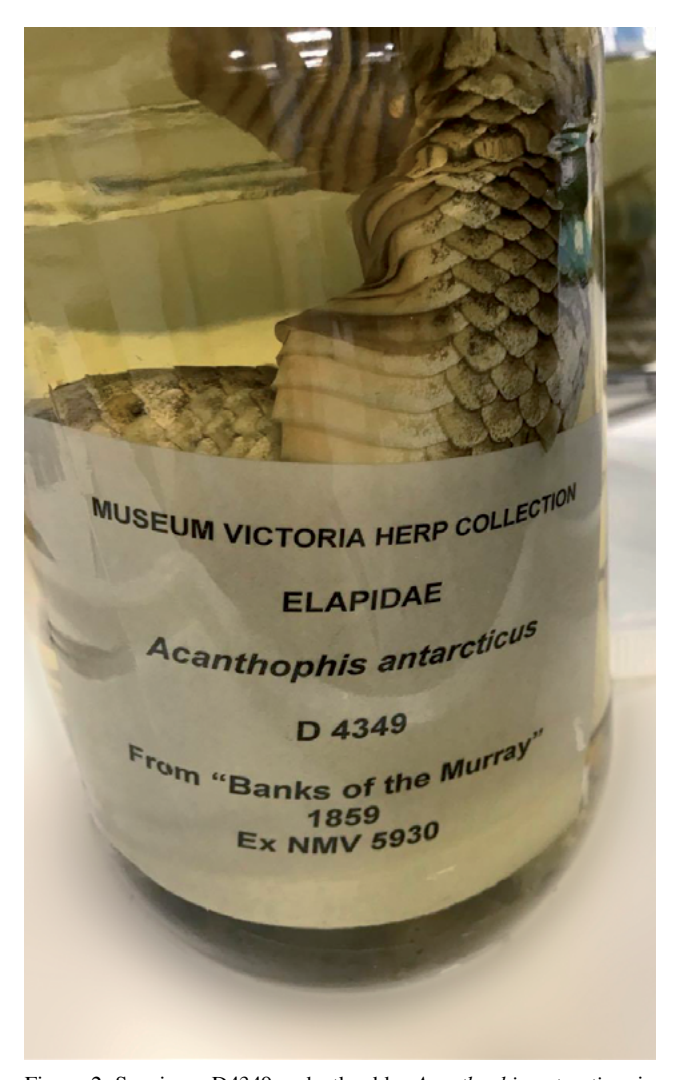
Figure 2. Specimen D4349, a death adder Acanthophis antarcticus in the collection of Museums Victoria.

Two other features of specimen D4349 accord well with Krefft's narrative. First, the length of the snake was estimated by Krefft to be "about 30" inches (this measurement is repeated on Krefft's illustration of the Lake Boga adder, pencilled adjacent to the full-body image). Using a piece of string to run along the body of specimen D4349, we measured its total length at 728 mm (28.7 inches), consisting of 635 mm (25 inches) snout to vent and 93 mm (3.7 inches) tail length. However, the tip of the tail has been lost, either deliberately cut off or broken, since collection (fig. 3). Given Krefft's concerns about the "poisonous sting on the end of the tail", it is plausible that the tail tip was removed while the snake was being processed by Blandowski and Krefft. With a complete tail, this specimen would be very close to 30 inches in total length and the tail would be very close to the five inches mentioned by Krefft. Second, Krefft notes that "the neck had been cut through". Specimen D4349 has an obvious broad wound on the dorsal surface of the neck (fig. 4). Certainty that this is the